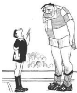
“Don’t give me that sad eyed look !”